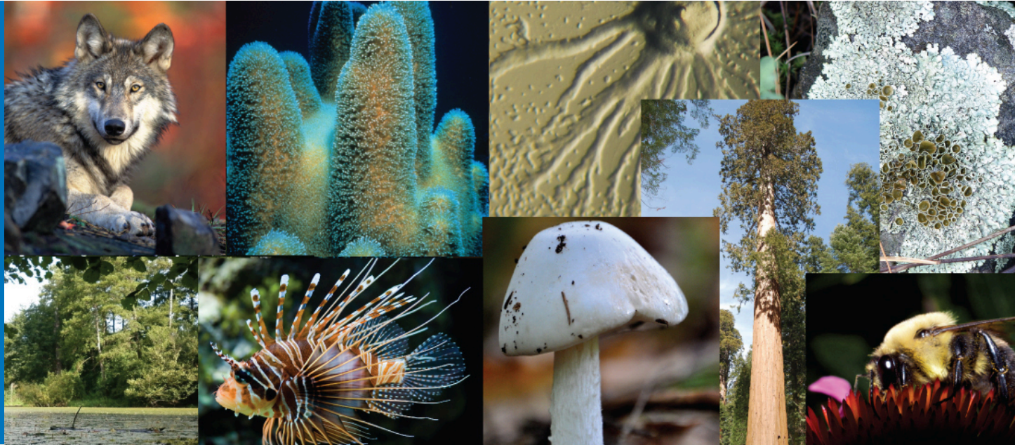
Figure 19.1 Living things may be single-celled or complex, multicellular organisms. They may be plants, animals, fungi, bacteria, or archaea. This diversity results from evolution.

INTRODUCTION All life on Earth is related. Evolutionary theory states that humans, beetles, plants, and bacteria all share a common ancestor, but that millions of years of evolution have shaped each of these organisms into the forms we see today. Scientists consider evolution a key concept to understanding life. It is one of the most dominant evolutionary forces. Natural selection acts to promote traits and behaviors that increase an organism's chances of survival and reproduction, while eliminating those traits and behaviors that are detrimental to the organism. However, natural selection can only, as its name implies, select—it cannot create. We can attribute novel traits and behaviors to another evolutionary force—mutation. Mutation and other sources of variation among individuals, as well as the evolutionary forces that act upon them, alter populations and species. This combination of processes has led to the world of life we see today.