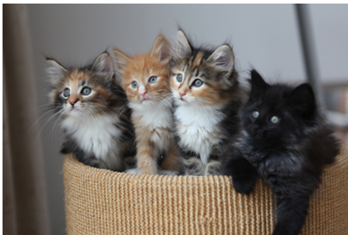
Figure 19.3 The distribution of phenotypes in this litter of kittens illustrates population variation.

A population's individuals often display different phenotypes, or express different alleles of a particular gene, which scientists refer to as polymorphisms. We call populations with two or more variations of particular characteristics polymorphic. A number of factors, including the population's genetic structure and the environment ( Figure 19.3 ) influence population variation , the distribution of phenotypes among individuals. Understanding phenotypic variation sources in a population is important for determining how a population will evolve in response to different evolutionary pressures.